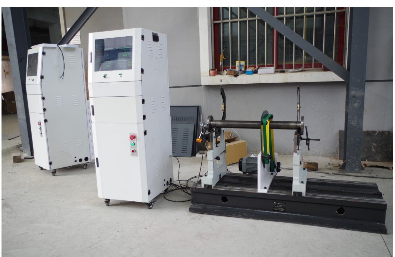
YYQ-160 horizontal hard support balancing machine